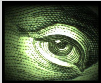
Segment of a $100 Bill

Please Contact Myriad Fiber Imaging Tech., Inc. Email: Sales@myriadfiber.com