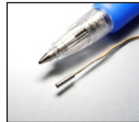
CIS Module Appearance