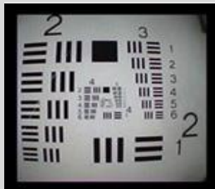
1951 U.S. Airforce Target