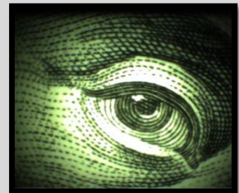
Segment of a $100 Bill

Please Contact Myriad Fiber Imaging Tech., Inc. Email: Sales@myriadfiber.com