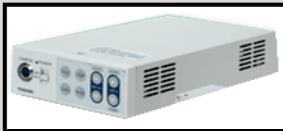
Camera Control Box