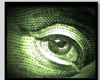
Segment of a $100 Bill

Please Contact Myriad Fiber Imaging Tech., Inc. Email: Sales@myriadfiber.com